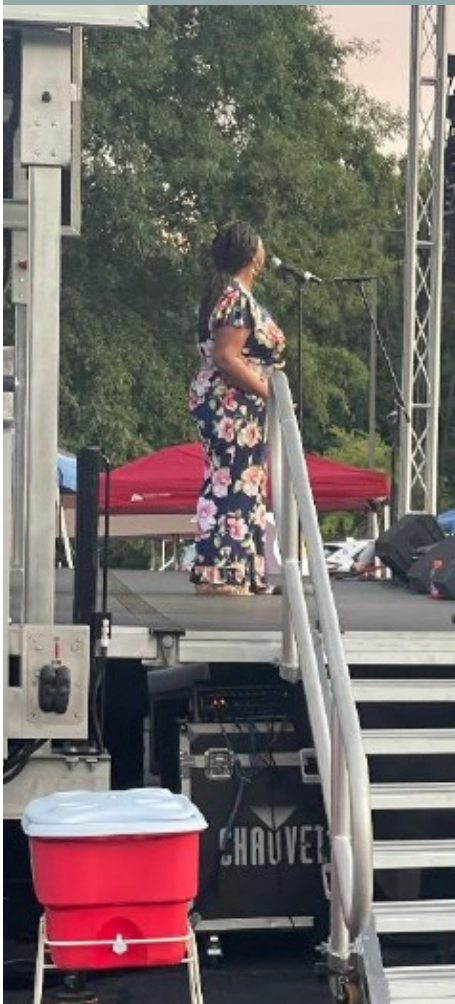
JAZZ UNDER THE STARS