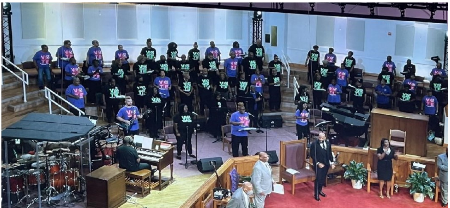
FAITH WORKS VOTER RALLY TOUR CHOIR-ATLANTA